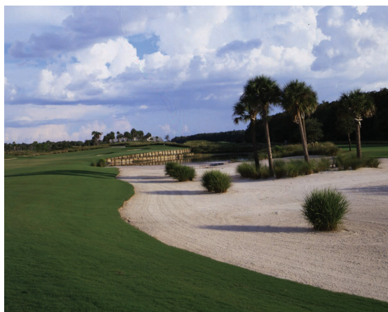
The 17th hole at TwinEagles, site of the Four-Ball Championship.

The qualifiers are filling quickly, so get your entry in now!