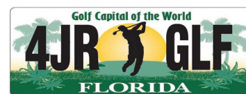
All proceeds from the new Florida golf tag program benefit Junior Golf.

The day was a huge success with many programs present and ideas shared to make Florida junior programs succeed.